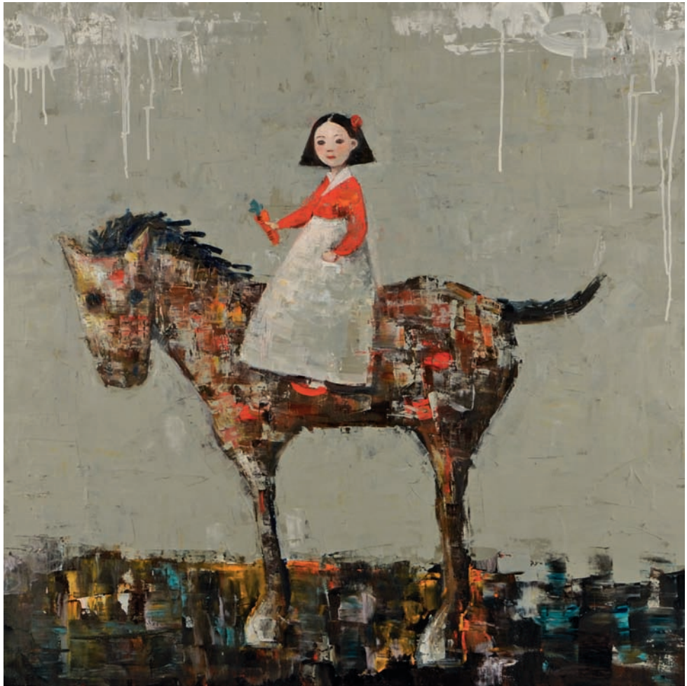
RIMI YANG: CARROT BUT LOVE, 91 CM X 91 CM, OIL ON CANVAS, 2011