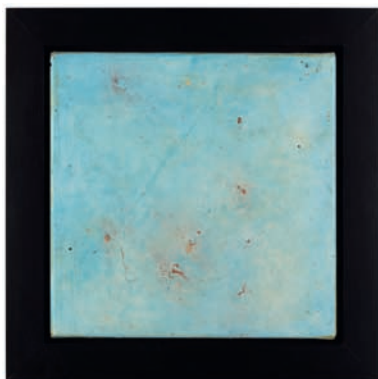
PIGMENT STUDY MMVII-III (FRA ANGELICA BLUE) FRESCO ON LINEN, 50,8 X 50,8 CM, 2007