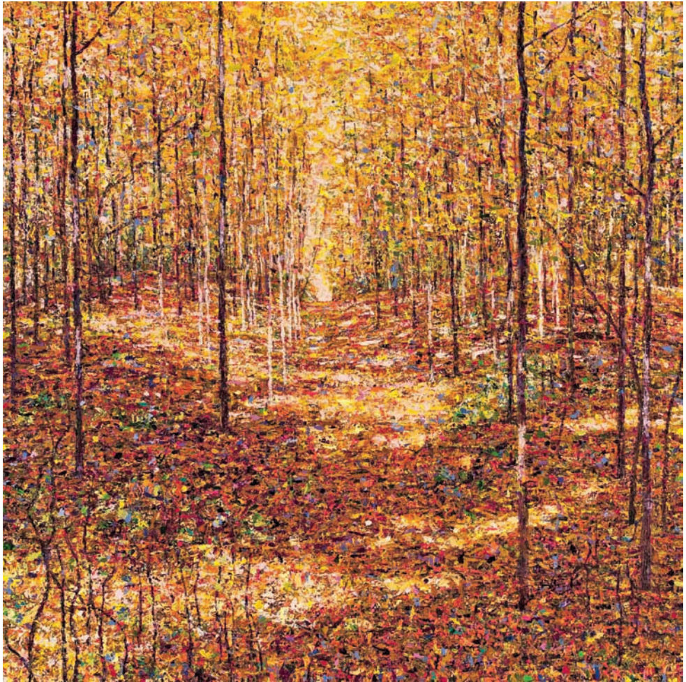
BRENT MCINTOSH: AUTUMN, BRUCE TRAIL NEAR CALEDON (SMALL VERSION), ACRYLIC ON CANVAS, 122 X 122 CM, 2011