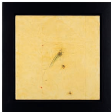
PIGMENT STUDY MMVII-IV (LIMONIE CYPRUS) FRESCO ON LINEN, 50,8 X 50,8 CM, 2007