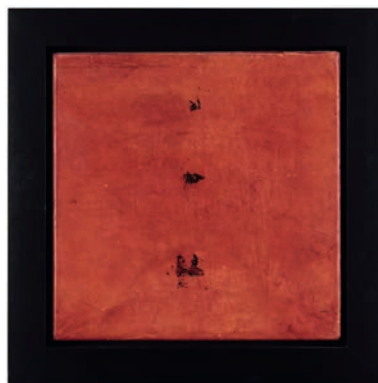
PIGMENT STUDY MMVII-II (PERSIAN RED) FRESCO ON LINEN, 50,8 X 50,8 CM, 2007

American artist, born in Scranton, PA (1949-2008).