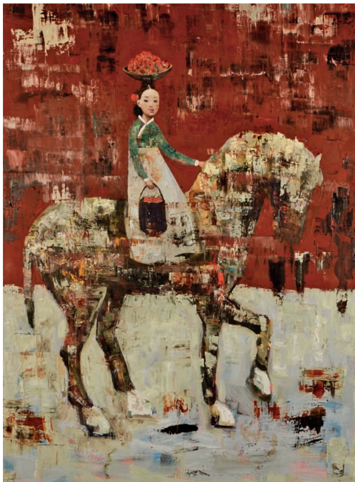
RIMI YANG: LUCKY YEAR, 122CM X 91CM, OIL ON CANVAS, 2011